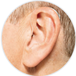
Muse iQ is available in a variety of styles and colors for your ideal fit.