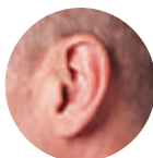
RIC 312 Receiver-In-Canal