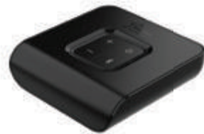
| TV |

Stream audio from your TV or other electronic audio source directly to your Livio hearing aids. It offers excellent sound quality, is easy to use and supports both analog and digital input sources.