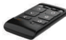
| Remote |

Easily stream from a variety of audio sources. And thanks to Remote Microphone +, Livio is the first hearing aid to feature Amazon® Alexa connectivity.